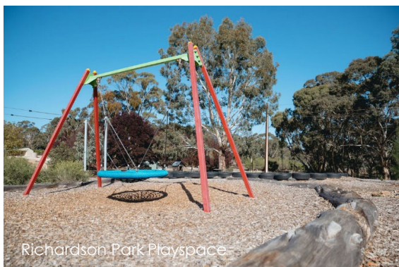
Richardson Park Playspace