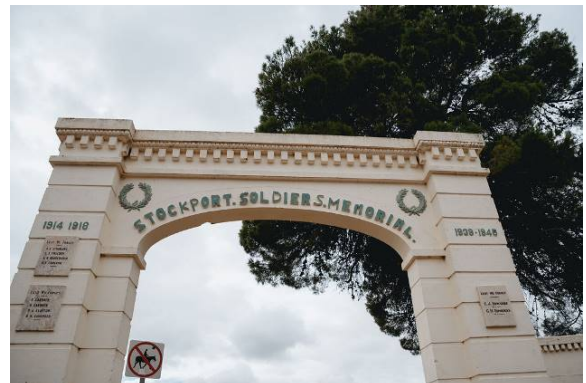
Stockport Oval and Tennis Courts