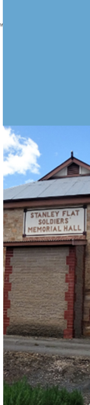
Stanley Flat Soldiers Memorial Hall

The hall is available for the use of the community as it has been for the last one hundred years. People beyond Stanley Flat are most welcome to join us or to hold events at the hall. Line dancing at the hall has recommenced in 2023 after an absence of several years. We are grateful to the Clare and Gilbert Valleys Council, our neighbours the Clare Racing Club and local businesses for their ongoing support and our volunteers whose many hours of work keep the hall functioning and in good condition.