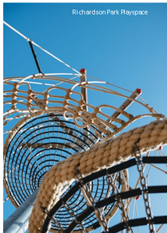
Richardson Park Playspace